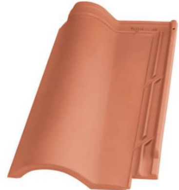
FIGURE 1 – TILE ILLUSTRATIONS