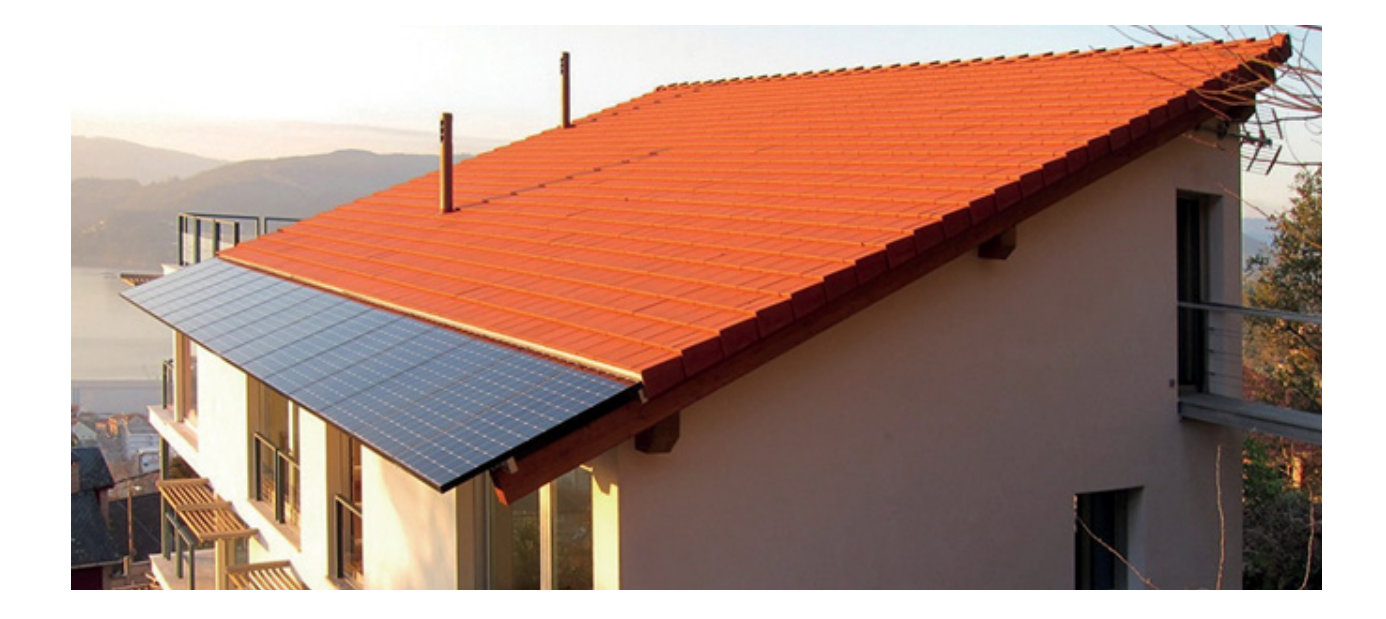
Figure 2. Installed product