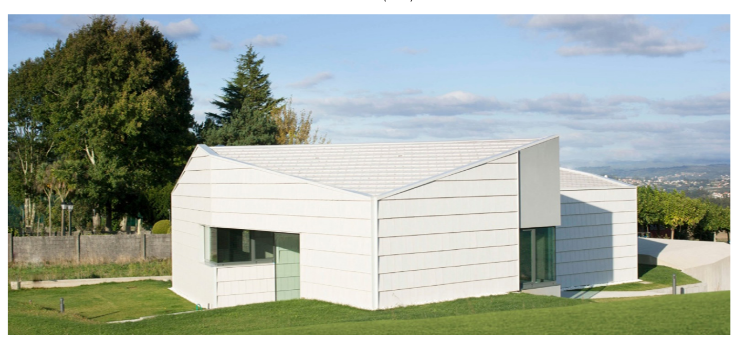
Figure 3. Installed product

A reference product service life of 150 years has been used, in keeping with the PCRs for EPDs for clay construction products, drawn up by the European federation of brick and roofing tile manufacturers (TBE).